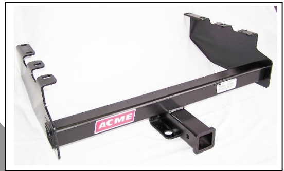
# 91516 • Fits 2001 – 2010 Ford F350 – F550 Cab & Chassis Trucks, 7 1/2" drop; Chevrolet 3500 Cab & Chassis Trucks, 7 1/2" drop