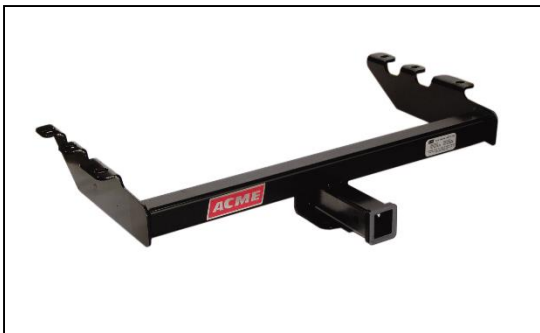
Heavy Duty Custom-Fit Hitches for Pickup Trucks, Vans & SUV's (All mounting hardware included)