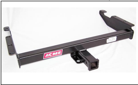
# 91478 • Fits 2001 – 2010 Chevrolet Silverado / GMC Sierra Pickup 2500 HD & 3500 HD Long Bed Only