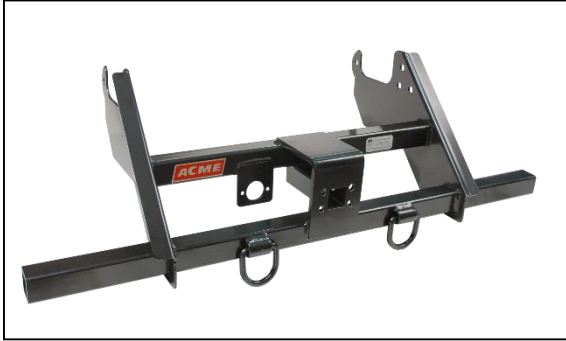
# 91601 Ford ICC Truck Hitch With Tilt Bed # 91603 Chevrolet ICC Truck Hitch With Tilt Bed